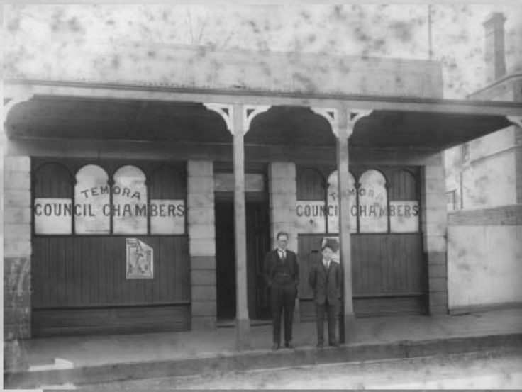
Temora's first Municipal Council Chambers, beside the Queensland Hotel.