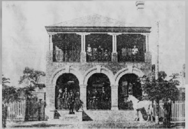
The first Temora Post Office on the present site, circa 1893.

The impressive office buildings of central Hoskins Street all date from the early years of the twentieth century. The Union Bank, now ANZ Bank, stands on the site of Temora's first general store. The present Post Office replaced an earlier building (inset) destroyed by fire in 1902. The Commercial Banking Company of Sydney commissioned the third of the buildings, now Creagle-Lisle Solicitors, in 1908.