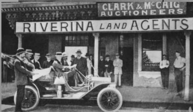
Clark & McCraig was one of numerous small businesses to occupy premises between the Empire and Queensland Hotels in the 1920's.

During the 1920's substantial brick buildings for the Strand Theatre, Rural and CBA Banks re-defined the streetscape and in the following decade, Jasprissa's Garage, later extended as "Sutton's Motors", completed the transformation