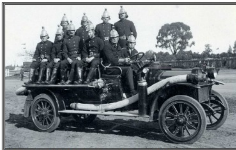
Picture taken in the late 1920's, was Temora's first petrol driven fire engine, a 1924 Garford pumper.