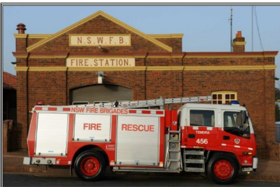
The current Fire Appliance stationed at Temora is a Type 2 Isuzu pumper which was installed on 28 June 2001. The identification number is Pumper 423. Compiled by Greg Matthews to commemorate 100 years under control of the NSW Fire Brigade, 11 January, 2010.