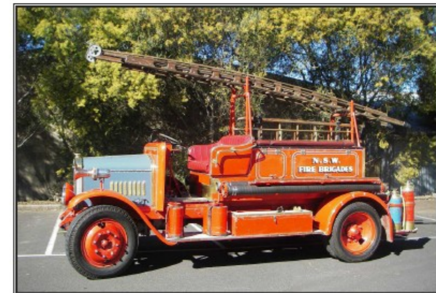
This Fire Engine is a Dennis Motor number 201 installed at the Temora Fire Station on 17 April 1931. The fire engine was purchased and restored by the Firefighters of the Orange brigade and remains on display in working order at the Orange Fire Station.