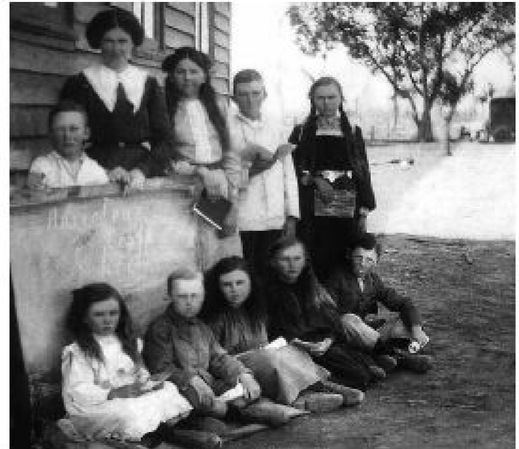
School Photo. (date unknown)

Attendance at the school peaked at 25 students in 1915 following the closure of the Edgefern school. However the numbers gradually declined after this and the school closed in 1924. The school building was moved to Moonbucca East.