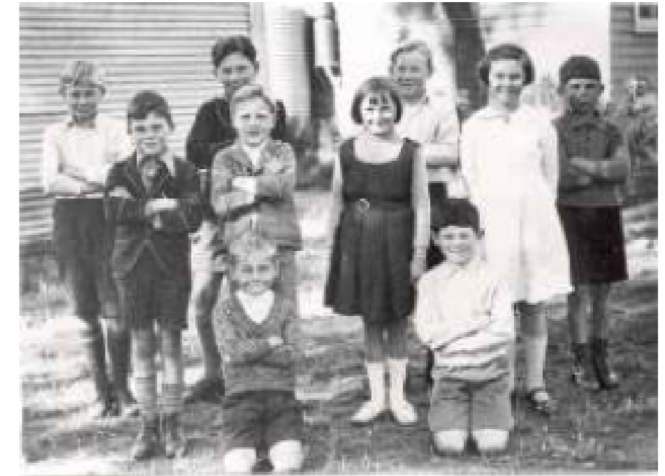
BAGDAD SCHOOL PUPILS—About 1937