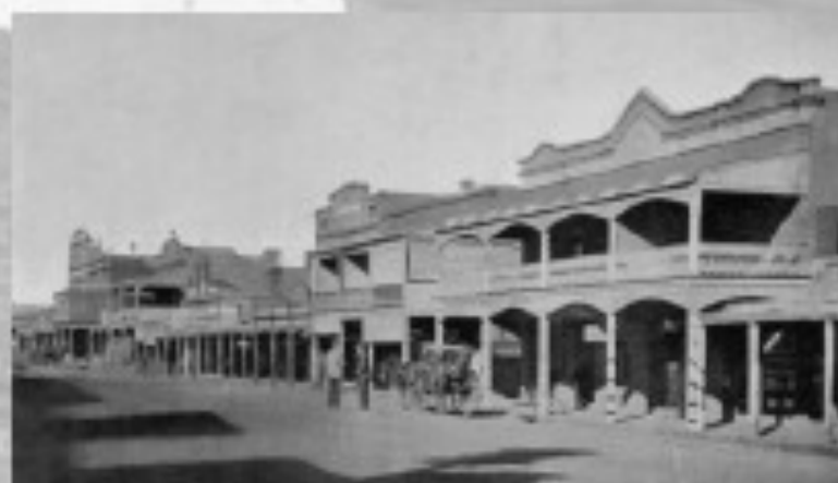
Tattersall's Hotel 206-208 Hoskins Street